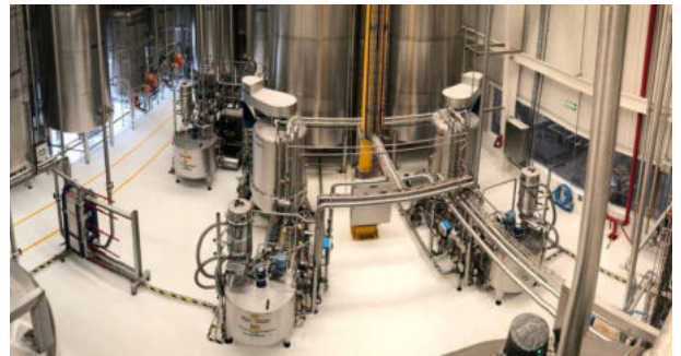
Sucroliq sugar refinement plant in Irapuato (MX)

Sucroliq has a vast experience in satisfying the different needs of their clients. With 3 facilities in Mexico, with an annual production capacity of 350,000 MT of liquid sugar, they are in the process of international growth.