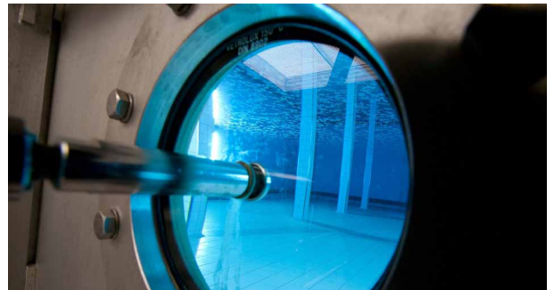
Reservoir belonging to Wasserwerk Reinach und Umgebung

“Wasserwerk Reinach und Umgebung” (water plant of Reinach and surrounding areas) is successfully using the Netilion Smart System to monitor river levels and key water quality parameters. The measured values can be monitored via smartphone and a distributed control system.