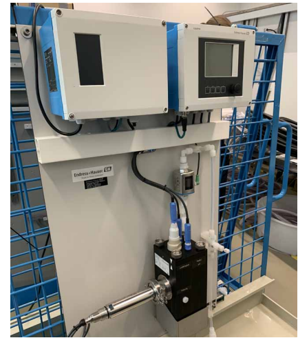
Analysis panel for processing measured values